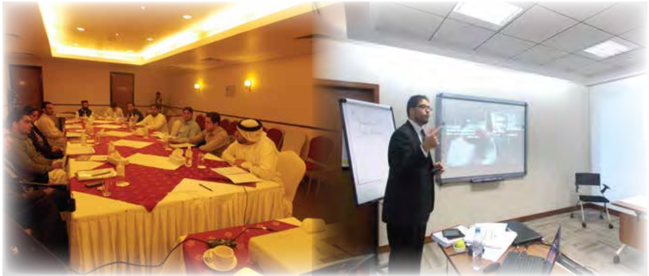
Trainings at Brainstorm

Our scheduled training are announced each month and the organizations who wish to register their employees for such training workshops can do it by providing us the required information, following the requirements in the brochure.