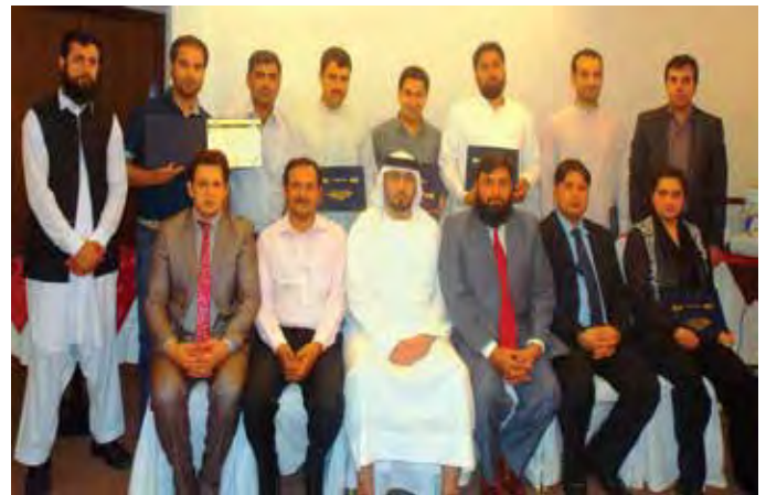
Training on Internal Audit and Control

Trainer plays the most important role in delivering a training. We therefore remain very strict in selection of a Trainer. The key abilities we assess while selecting a Trainer for a course include; understanding the technical content of the training, presentation skills, and his methodology and style of preparing training material and working with the trainees/students.