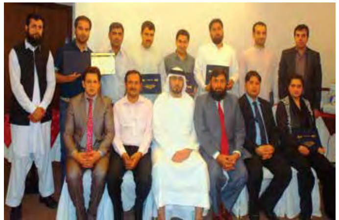
Training on Internal Audit and Control

Trainer plays the most important role in delivering a training. We therefore remain very strict in selection of a Trainer. The key abilities we assess while selecting a Trainer for a course include; understanding the technical content of the training, presentation skills, and his methodology and style of preparing training material and working with the trainees/students.